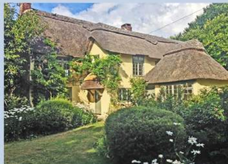
BECK COTTAGE, WOODGREEN, NEW FOREST

A listed 3 storey, 5 bedroom, 3 bathroom (2 en-suite), period townhouse which sleeps 10 with garden and off road parking for 4 cars.