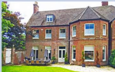
QUAY HOUSE, CHRISTCHURCH

A Georgian 3 storey, 6 bedroom, 4 bathroom (3 en-suite), townhouse which sleeps 15, with a large garden and off road parking for 4 cars.