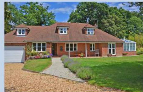
MEWS HILL, FORDINGBRIDGE, NEW FOREST

Conservatory, games room with table tennis and table football, separate dining room, large kitchen/diner, ground floor bedroom with en-suite and wood burner in lounge. Perfect for families and pets.