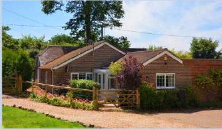
CRIDDLESTYLE COTTAGE, FORDINGBRIDGE NEW FOREST

A spacious 5 bedroom, 3 bathroom (2 en-suite), one storey cottage, sleeps 10, with a large high level beamed sitting/dining room with wood burner. A great family venue with disabled wet room, jacuzzi bath, large garden with trampoline and parking for 4 cars.